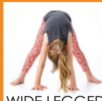
WIDE LEGGED FORWARD FOLD