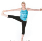
HAND TO TOE